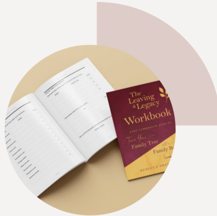
The Leaving a Legacy Companion Workbook