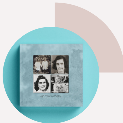
90 Years of Sally