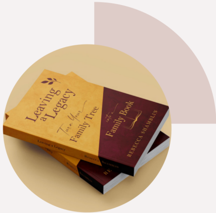
Leaving a Legacy: Turn Your Family Tree into a Family Book